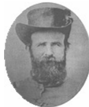
Br. Gen. John T Hughes

March 25-26, 2011 Missouri Division Renunion Jefferson City, Missouri. Parson's Camp has a great reunion lined up! Registration form enclosed!